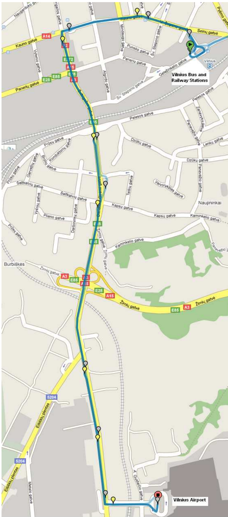
The route of bus No 1 and train from Vilnius Airport to Vilnius Bus and Railway stations